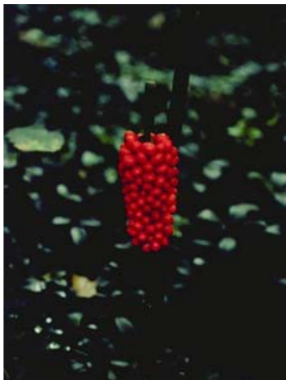
Arisaema Seed Pod

But one should know that the plant is poisonous. The oxalic acid and asparagines in jack in the pulpit are poisonous if ingested and the root is the most dangerous. Calcium oxalate crystals will cause a powerful burning sensation if eaten raw. The Native Americans used the root as a vegetable after cooking it thoroughly.