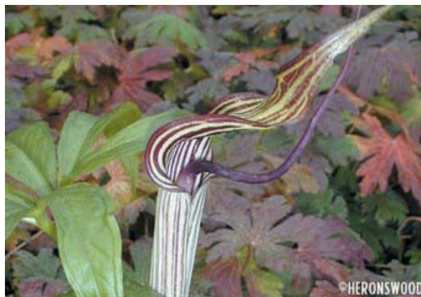
Arisaema thunbergii ssp. Urashima