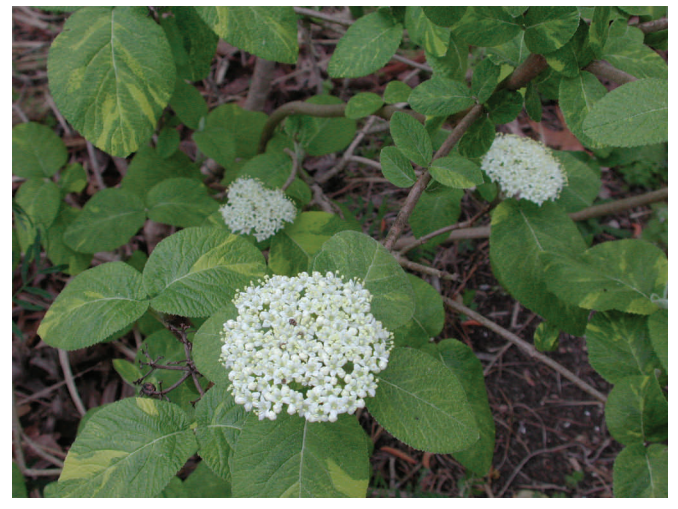
Viburnum lantana 'Variegarum'

counteract their distaste, I take them to the nearby blooming V. x juddii to partake of its intoxicating sweet fragrance. Viburnum x pragense is a very hardy evergreen suitable as a specimen or for screening and has beautiful pink flowers and lustrous textured leaves, to boot. Vibur num lantana 'Variegatum' has a small, flat creamy-white flower that sits above its creamy-yellow variegated foli-