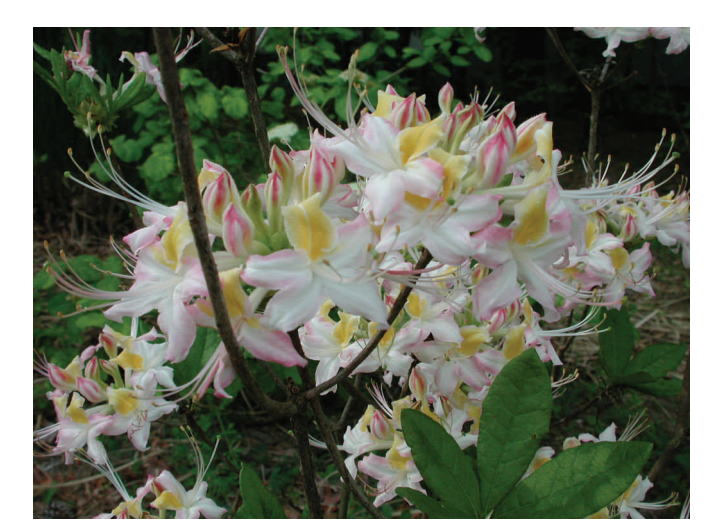
Rhododendron Pastel #23

Deciduous native azaleas are fantastic additions to the woodland garden. However, they do appreciate some sun. After moving my Piedmont Azalea, Rhododen dron canescens , to three different locations, it has found its home at the top of the driveway where it is now over seven feet tall. It is a joy to walk up the driveway when it is in bloom as the fragrance wafts all the way down the hill. After we stopped using the weed eater to cut down all the undergrowth, I was overjoyed to find the Piedmont Azalea indigenous to the property, living on the edge of the woods. Many of the native azaleas I purchased did not fare very well. A huge success is a purchase named Rhododendron Pastel #23, found in the wild