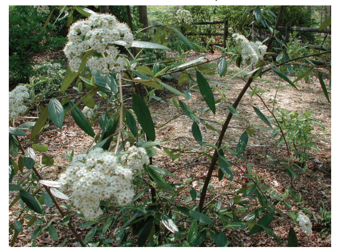
Viburnum x pragense

To get back to Viburnums (the first of which died in my unamended soil), I now grow many different species. In early spring, fragrance permeates the air when the pink flowers of Viburnum carlesii bloom. I often tease visitors by having them crush and smell the leaf of V. siebolidii , which has an extremely fetid odor. To