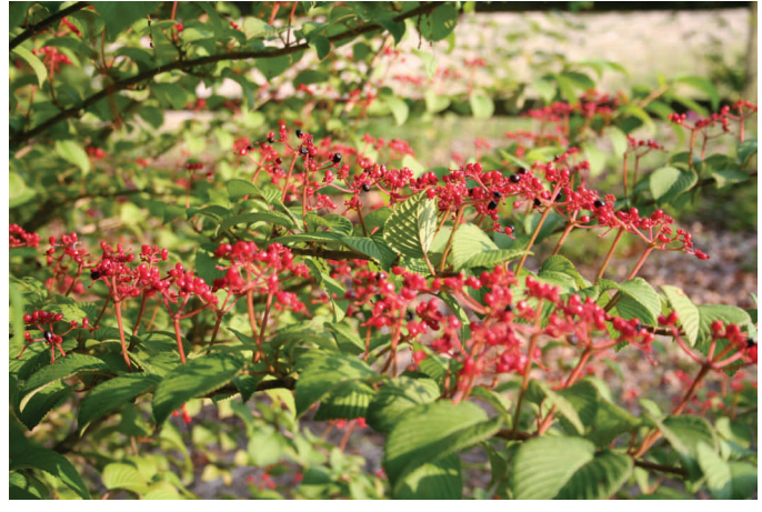
Viburnum plicatum tormentosun berries

I have not yet found a Viburnum that I don't love. Of course the first Viburnums I purchased were