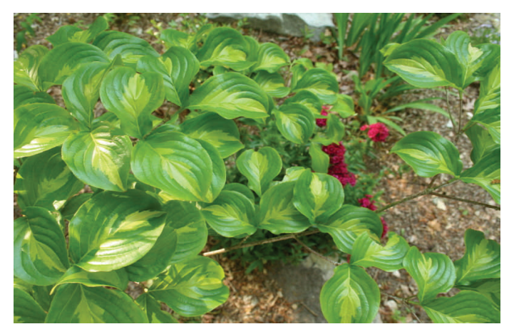
Cornus kousa 'Gold Star'

unique flowering spikes in colors of purple and orange. Cornus kousa 'Gold Star' is a superior slow-growing Asian