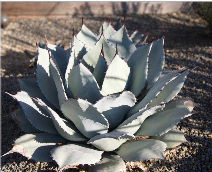
Agave parryi subsp. parryi var. huachucensis

Also in this area are some large succulents sometimes known as the woody