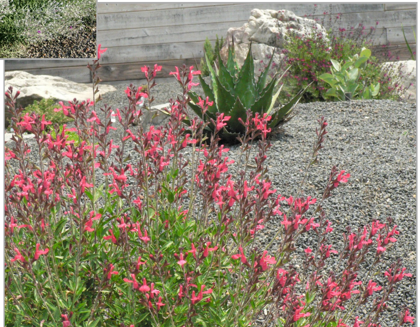
Salvia in the xeric garden - JC Raulston Arboretum

The JC Raulston Arboretum's xeric gardens merit a visit at any time of year, whether it's for the vibrant colors of spring and summer or perhaps just for the variety of foliage color and texture that persists throughout the year. If you encounter me in the xeric gardens staring at the light shining through the teeth of an agave or daisy-lirion, feel free to tap me on the shoulder and interrupt my reverie. I probably need to get back to weeding. ☞