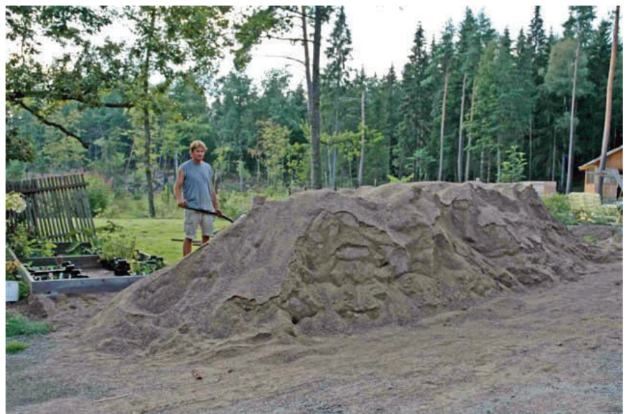
Get a big pile of sand

I have now stopped using any kind of compost in my rock gardens