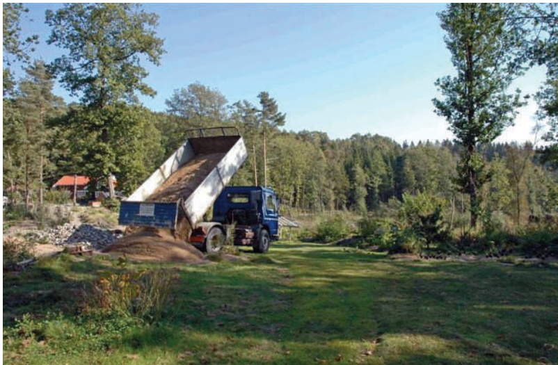
Dumping a load of sand

I don't use the finest grade sand, as it can be too compact. When I moved to Eskilsby, I ordered sand from all the local gravel pits so that I could test which was the best in which to plant. There were clear differences, but I don't know what they were. I did not send the