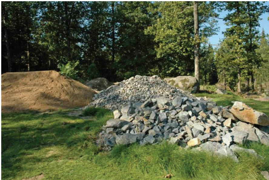
Rocks to cover the sand

sand for any kind of analysis and was content to conclude that the sand from Landvetter area was the