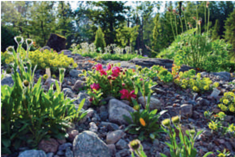
One view in Peter Korn's garden—the north-facing rock garden

ten causes me problems. The spring sunshine frequently kills more plants than the winter. Sand does not contain so much water, so the ground frost is not so hard and melts very quickly when the sun warms the surface. This gives the plants a source of water so that they do not wither to death. Sensitive evergreens fare much better in sand.