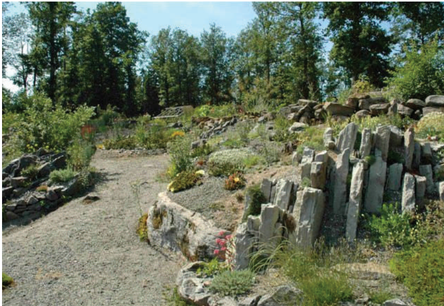
South-facing slope after planting and rock placement

The siting of the rock garden is the most important consideration, depending on what you wish to grow in it. But you can make a sand bed anywhere. All you have to do is choose plants to suit the location. A rock garden is often sited in a south-facing position, making it suitable for many plants from the