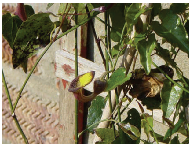
with permission. Long Island Chapter newsletter.