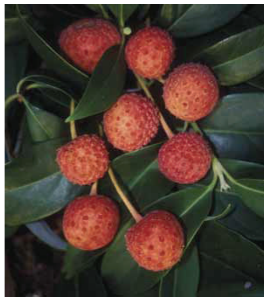
Cornus angustata 'Empress of China' fruit

Bring plants (free) to swap with fellow chapter members — no plant sale or auction at this event