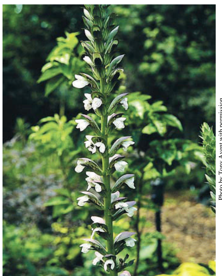
Acanthus 'Summer Beauty'