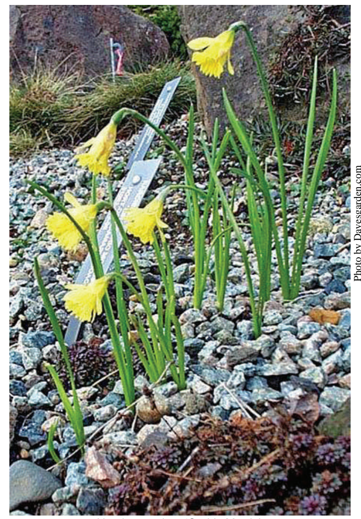
Narcissus minor 'Cedric Morris

ter interest. Tony Avent reports that it has 18" narrow green leaves and 2" fragrant light lavender-purple flowers. It needs a well drained location.