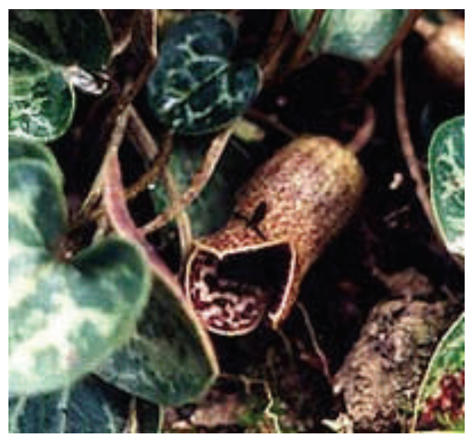
Asarum shuttleworthii var. harperi 'Callaway'

Arist ifolia has arrow shaped leaves as the names suggests while shuttleworthii has more rounded leaves. Polished green leaves some