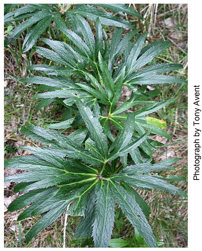
Helleborus multifidus istraicus

They stopped next at 1,300' elevation in an interesting patch of woods where they found more Helleborus niger , this time mixed in a hybrid swarm with the wide-leaf Helleborus multifidus ssp. istri acus x Helleborus torquatus . The variation in Helleborus niger here was quite odd, suggesting again the possibility of some species intergrades. Another particular huge-leaf form of Helleborus niger had unusually large overlapping leaf lobes. Unfortu-