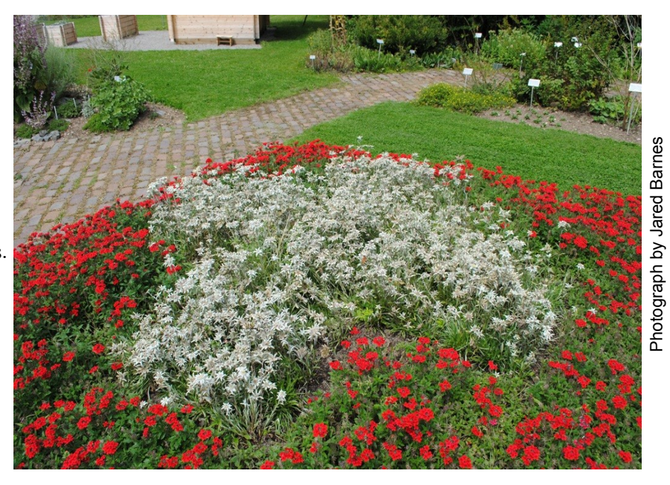
The Swiss flag composed of Leontopodium alpinum for the white and Verbena for the red.

Stone slabs were scattered amongst knee high vegetation, which conveyed a feeling of a contrived rocky prairie. Echinops ritro and Eryngium campestre were in flower to provide splashes of color amongst the green. Various geophytes also helped. The gardeners had nicely paired the white flowers of Galtonia candicans with the bluegray foliage of Yucca and Euphorbia species. A few onions were in flower like Allium nutans, A. flavum, and A. carinatum var. pulchellum. The latter was my favorite of the three because the flowers resembled exploding, lavender-colored fireworks. Besides the rock garden, the botanic garden here was quite diverse and had many different sections, including a water garden, a North American natives area, and a colorful border near the street. Scattered