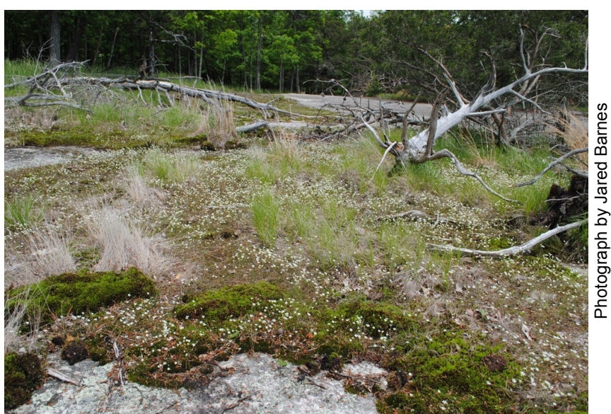
A carpet of moss and Arenaria on Stone Mountain, North Carolina

For Nature, rock gardens are a no brainer. On top of Gregory Bald she has ef-