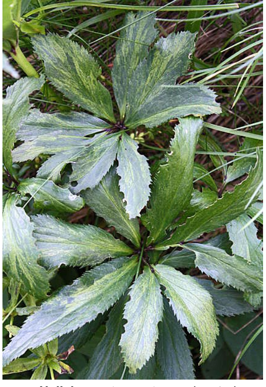
Helleborus torquatus variegated

differed much from the other forms seen on the trip. Also here was an amazing ajuga with 18" flower spikes, that was assumed to be Ajuga genevensis, and a charming little scutellaria that resembled