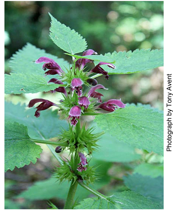
Lamium orvala in flower

The next stop was Croatia. South of Rude, at 1,700' elevation at a roadside memorial, Ruscus hypoglossum , was found with some fruit remaining...always good to help distinguish male plants from the fruiting females. Paris quadrifolia was more plentiful here than anywhere else on the entire trip, growing alongside Arum maculatum and an interesting euphorbia. Also plentiful at this site was one of Tony's favorite lamiums, the clumping Lamium orvala , although most of the flowers had already finished at this