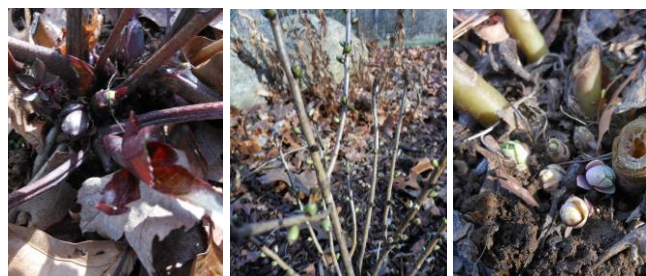
Looking forward to spring: buds of Helleborus 'Molly's White', Daphne mezereum , Hylotelephium ( Sedum ) cv.